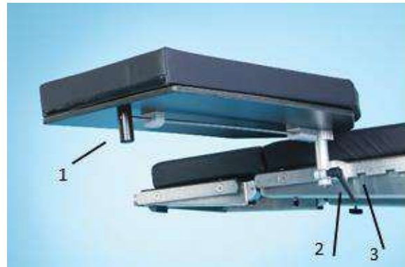
Extra-Wide Adjustable Height Armboard

(1) Directional Trigger, (2) Adjustable Handle (3) Release Trigger