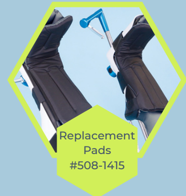
Replacement Pads #508-1415