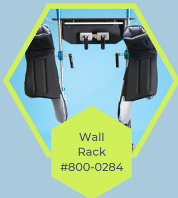
Wall Rack #800-0284