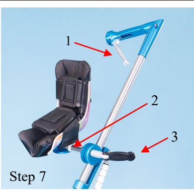
(1) Trigger Handle (2) Free Floating Boot Pivot (3) Boot Clamp