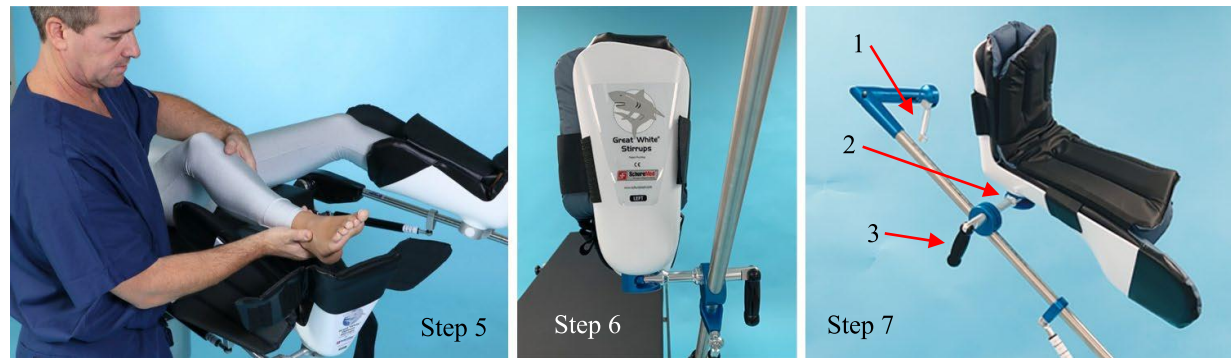
(1) Trigger Handle (2) Free Floating Boot Pivot (3) Boot Clamp

4. Ensure patient is positioned on surgical table in accordance with procedure and surgeon requirements. WARNING!! To prevent patient or operator injury from inadvertent stirrup movement, securely tighten accessory clamp and boot clamp.