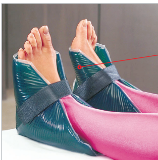
Oasis Heel & Ankle Protectors #804-0096