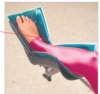
Oasis Boot Stirrup Pads #804-0094