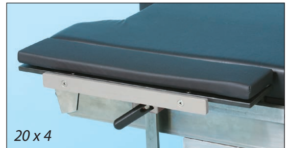
20 x 4

Phone 888.724.8763 • 781.982.7000 | Fax 781.982.7001 | www.schuremed.com