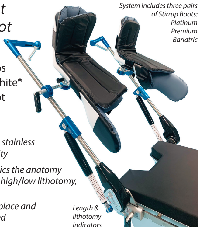
System includes three pairs of Stirrup Boots: Platinum Premium Bariatric