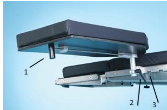
Extra-Wide Adjustable Height Armboard

(1) Directional Trigger, (2) Adjustable Handle (3) Release Trigger